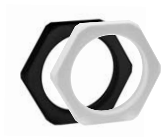
Type KGM: Standard nut, plastic