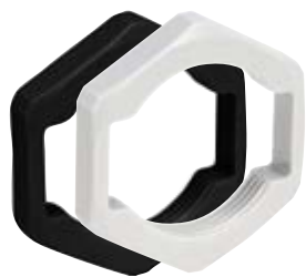
Type KGM: SUB-D9, PB, SUB-D25