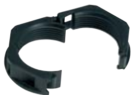
Type GMT: Split locknut